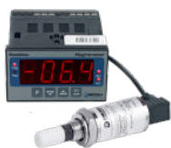
Easidew Online Dew-Point Hygrometer