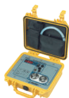
MDM50 Portable Hygrometer