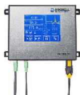
Optidew 501 Chilled Mirror Hygrometer