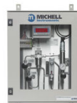
ES20 Compact Sampling System

Michell Instruments adopts a continuous development programme which sometimes necessitates specification changes without notice. Issue no: MDM300_97156_V9.7_EN_0223