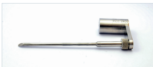
PicoVACQ 1Td with a rigid parallel probe