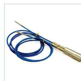
PicoVACQ Long 2Td with Teflon® PFA probes