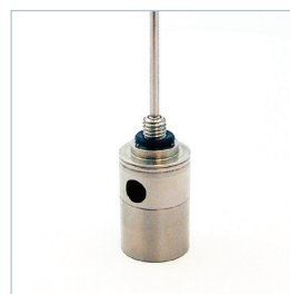
PicoVACQ 1Tc with a thread and an O-ring