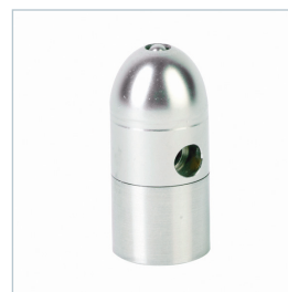
PicoVACQ microwave bullet