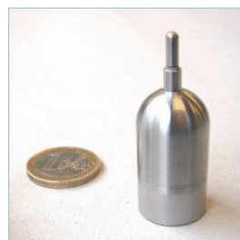
PicoVACQ microwave shield