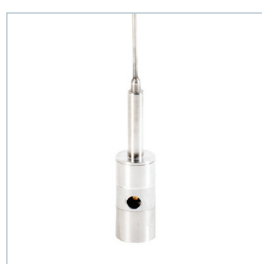
PicoVACQ 1Td with a threaded semi-rigid probe