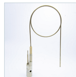
PicoVACQ Tc-Td with a semi-rigid probe