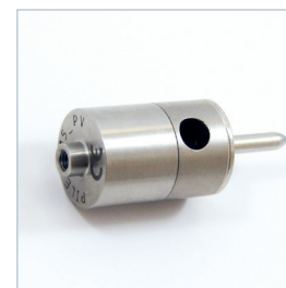
PicoVACQ 1Tc, battery with a thread