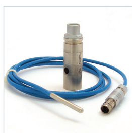
PicoVACQ 1Tdi with an interchangeable Teflon PFA flexible probe