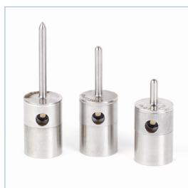
PicoVACQ 1Tc with different probes