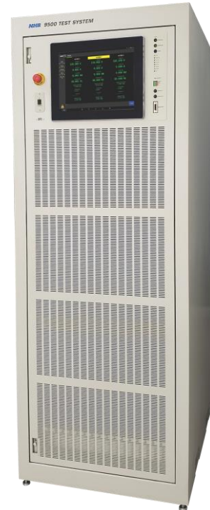
Figure 1- Regenerative Grid Simulator - 9510

Sustainability initiatives across the globe are accelerating the electrification of vehicles, charging infrastructure, new energy deployments, and grid modernization. Increasing demands on the grid and new opportunities for distributed energy resources such as solar, wind and energy storage, require modern test solutions to simulate the grid.